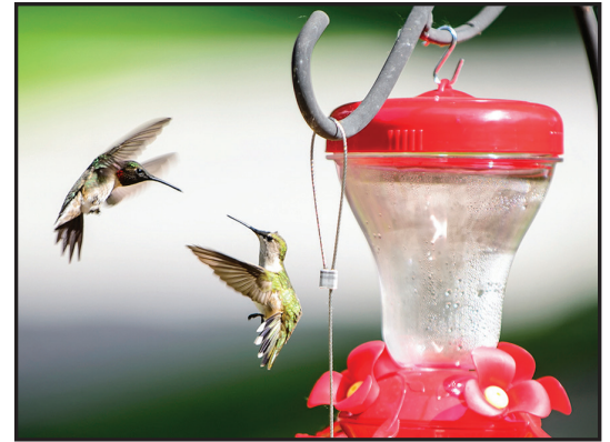
Hummingbird at feeder.

Fall migration is when we're most likely to see hummingbirds regularly in our gardens. They pass through briefly on spring migration, and can remain all summer if you're along waterways or other favored spots, but in fall they are in larger numbers and can stay and feed from August into October.