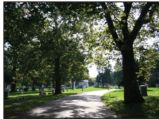
Forest Lawn Cemetery in north Omaha has been open since 1885. It was designed as a park with wide, hard-surfaced roads and rolling hills that wind through a forest-like setting. It's the only cemetery in the midwest that is an Arboretum and a Bird Sanctuary, and its 349 acres include four Nebraska State Champion Trees.