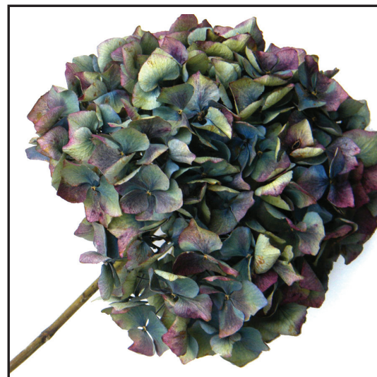
Hydrangeas are best cut August-October when they are somewhat dry and begin to feel papery.

Plants not mentioned above that dry well include: Artemisia, black-eyed Susan, globe thistle, sea lavender, sunflower. Some of the best seed pods are: love-in-a-mist, Baptisia, beebalm, milkweed, penstemon, poppy, coneflower, Siberian iris, hibiscus and sumac.