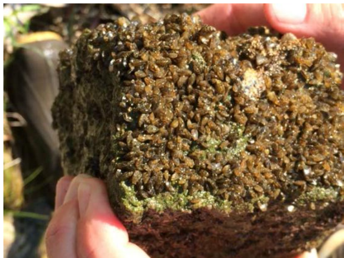
Zebra mussels on a rock at Offutt Air Force Base Lake in June 2014

Funding is needed to implement a statewide aquatic invasive species program, including a formal boat inspection program at high risk waterbodies.