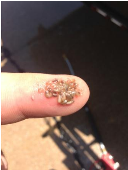
Zebra mussels found on a pontoon at Harlan Reservoir

Aquatic invasive species impact all water users; anglers, boaters, farmers and industry.